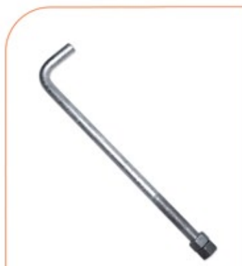
FST169 Galv. Anchor Bolt 16mm