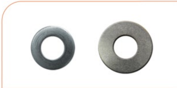
FST527 M10 X 21 X 1.2 SS FST524 3/8 X 1 X 16G SS