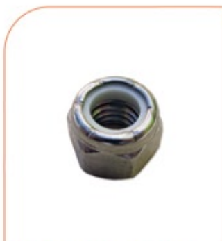
FST539 Nyloc Nut 3/8 SS