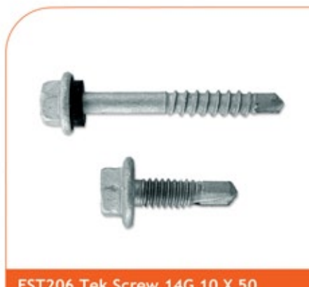
FST206 Tek Screw 14G 10 X 50 FST195 Tek Screw 14G 10 X 22