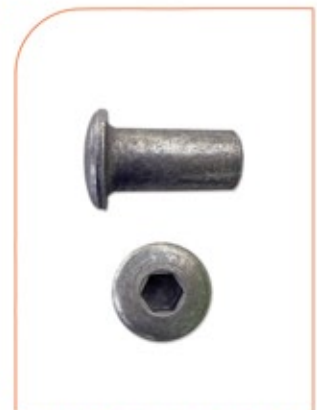
FST127 Touch Nut 3/8 ZP