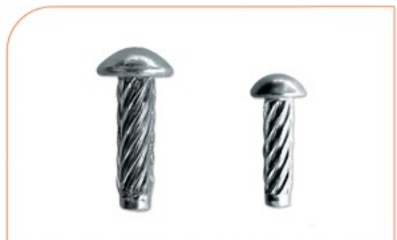
FST158 U-Drive Pin Large FST510 U-Drive Pin Small