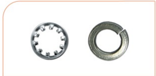
FST529 Shakeproof M10 SS FST531 Spring Washer SS