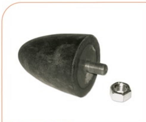
FST701 Pivot Buffer