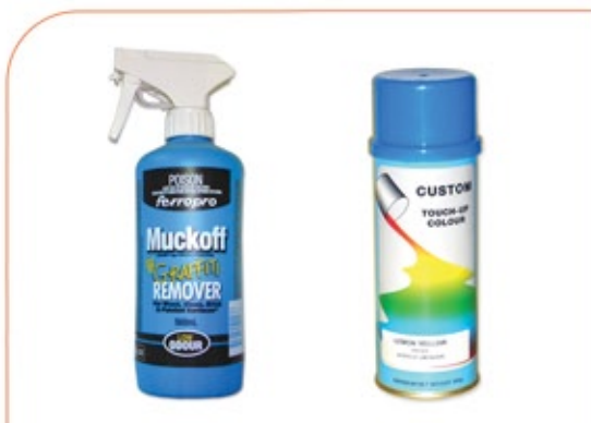
PNT002 Muckoff Graffiti Remover Touch up paint. All standard colours